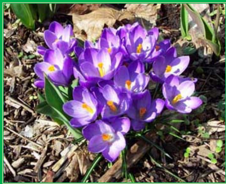
Ruby Giant Snow Crocus

There are some things that, when they happen, warm my heart and reassure me that spring is indeed on the way. The arrival of robins and grosbeaks is one such harbinger but the colourful, small trumpets of snow crocus (above) are my favourites! Lately, as we've been gearing up to re-open for spring, we've been getting phone calls and meeting people who are anxious to know when we'll be opening because, apparently, when we re-open each March that's their sign that spring is here!