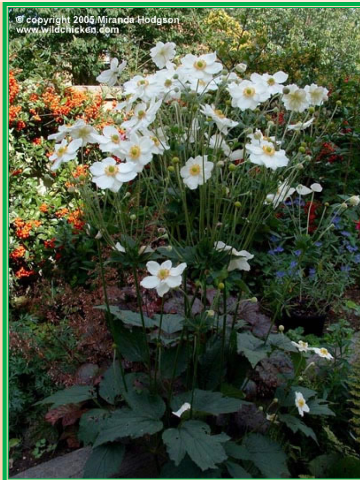
Anemone x 'Honorine Jobert'

Hardy to Canadian Zone 5, this is one of the best perennials for late season colour in the garden. With prolific white blooms that dance like butterflies above the foliage from late summer through fall, the white flowers are a standout in a partially shaded garden and it's even deer resistant, too.