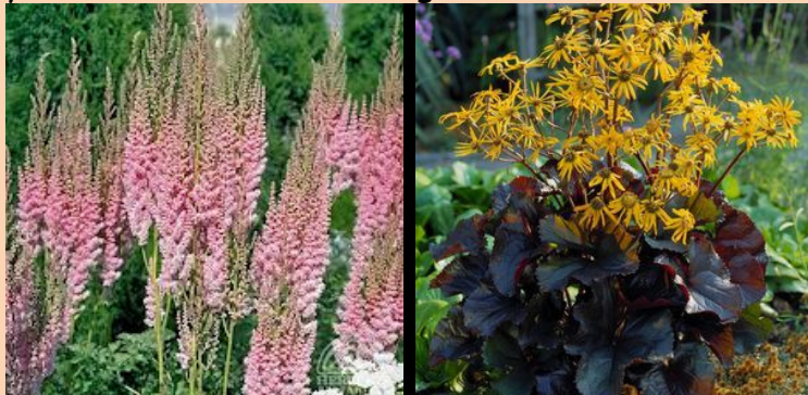
Astilbe chin. taquetii 'Superba' Ligularia 'Britt Marie Crawford'

Ligularia While you're sitting in the shade you might want to do something useful. Take inventory of which plants work and which don't and see if you need more, or other, plants to perk things up. Our 'Plants of the Week', Astilbes and Ligularias, are both great shade plants and because they're hardy perennials will provide years of garden interest.