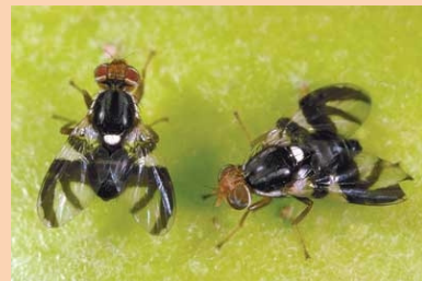
Apple Maggot Fly