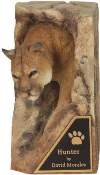
'Hunter' by David Morales, 4" high