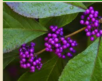
Callicarpa bodinieri var. giraldi 'Profusion'

In spite of being rated as hardy only to Zone 6, this plant has grown in my Zone 5 garden for more than 15 years. Admittedly, winters like last year's, with poor snow cover, are hard on it but it has re-grown from the roots and is now bearing its signature bright purple berries. There is absolutely nothing else like it! The berries look amazing in the garden but really add 'POW' to a fall arrangement of oranges and yellows. We have only a few plants left and they're 35% off.